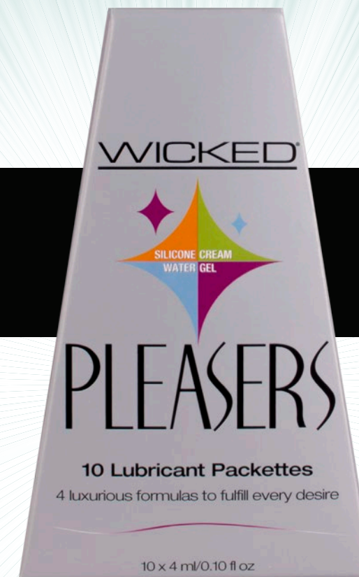
WICKED PLEASERS Lubricant Packettes (4 Unique Lubricant Options In Individual Foil Packettes)