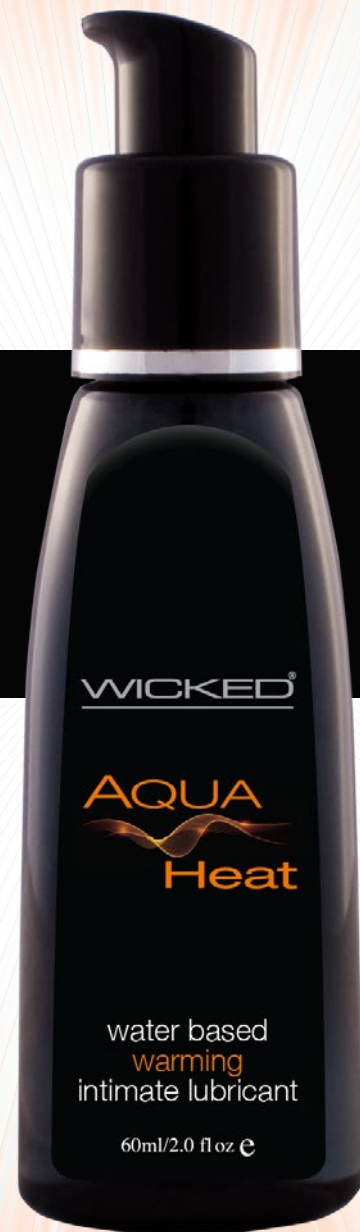
AQUA Heat Size: 2.0 fl oz/60 ml

Aqua Heat lets you play with fire and not get burned. A unique blend of warming elements thrill your erogenous zones with pleasure while the advanced water-based formula helps enhance personal moisture. Let the fire build as waves of warmth stimulate & excite. Gentle for all skin types and safe for use with all toys. Try this highly arousing lube with a partner or alone.