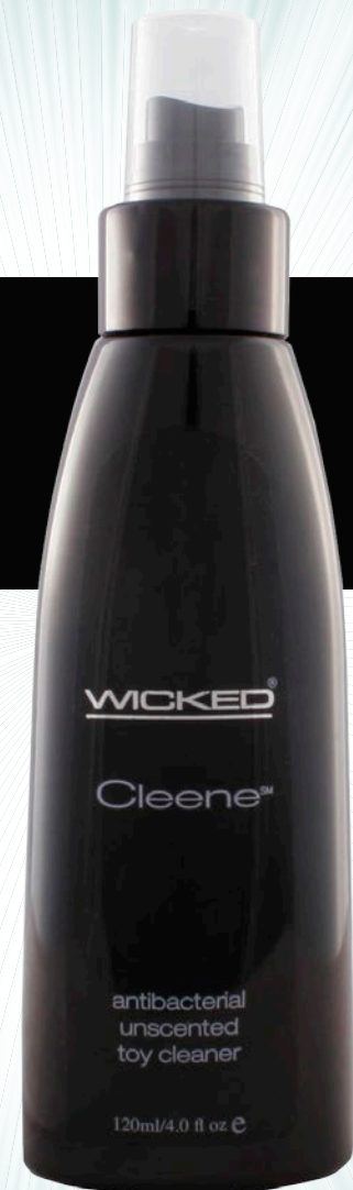
CLEENE Antibacterial Toy Cleaner Size: 4.0 fl oz/120 ml

Keep your toys safe and your intimate areas healthy with CLEENE Antibacterial Toy Cleaner . Enhanced with natural Lavender and Olive Leaf Extracts to boost anti-bacterial effectiveness, Fragrance-Free Cleene is convenient and easy to use.