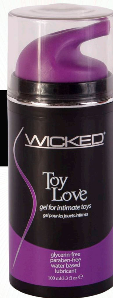
Toy Love Gel for Intimate Toys