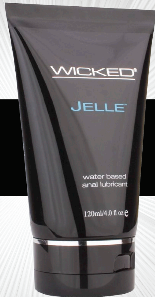
JELLE Water Based Lubricant for Anal Play Size: 4.0 fl oz/120 ml

With decades of experience in pleasure, the creators of Wicked have thoughtfully crafted Jelle Anal Lubricant to address the specific needs of anal play. Very viscous, long lasting and never sticky, this super-slick, water-based lubricant stays where you put it and provides extra cushion and superior glide. Desensitizers have been eliminated from the luxurious formula to ensure safety, sensation and pleasure.