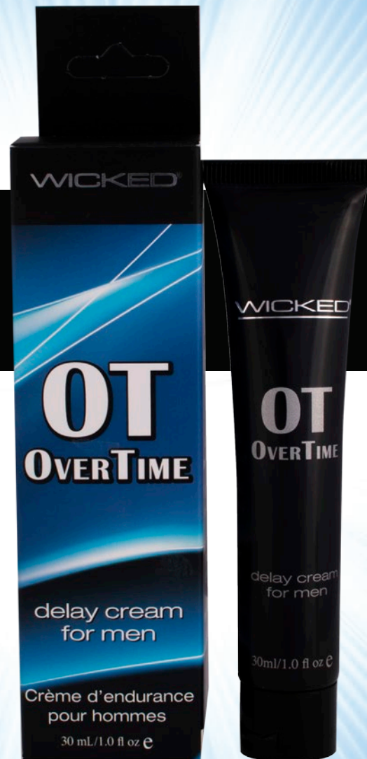
OVERTIME Delay Cream For Men Size: 1.0 fl oz/30 ml

OverTime Delay Cream for Men temporarily reduces hyper-sensitivity to the penis, which helps to delay ejaculation. The unique no prescription formula with 5% Benzocaine, gently eases the intensity of sensation and allows you the ability to put your love-making into overtime.