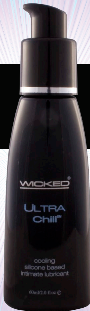
ULTRA Chill Size: 2.0 fl oz/60 ml

ULTRA Chill is a tingling blend of cooling extracts and high performance silicone designed to heighten sensitivity at your pleasure points. Thrilling sensations enhance natural lubrication while the highest quality silicone adds moisture and glide. Intensely arousing and satisfying.